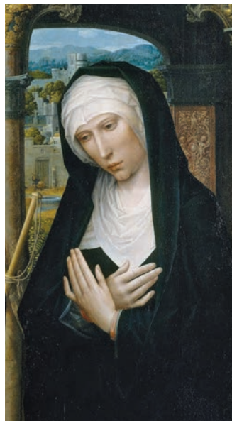
Christ Crowned with Thorns (Euse Homo), and the Mourning Virgin (detail), 1520s, Adriaen Isenbrandt